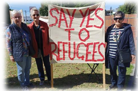
Palm Sunday Vigil Bairnsdale

CLC members participated in the rally and march in Melbourne, Bairnsdale, and Ballarat, advocating for humane treatment of our asylum-seeking brothers and sisters in Australia and offshore detention who have been waiting many years for fair and just treatment by the Australian Government.