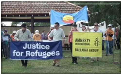
Palm Sunday Rally Ballarat